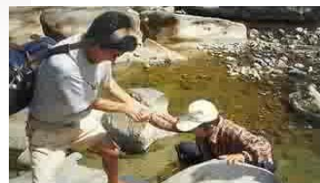
A ministry trip to the mountain village. A local Pastor is pulling me up on the way. The trail is very difficult. There was a big stone...