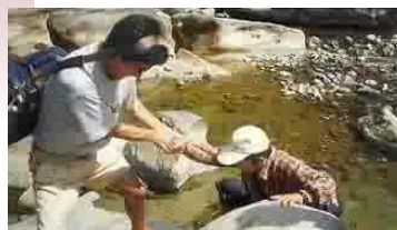
A ministry trip to the mountain village. A local Pastor is pulling me up on the way. The trail is very difficult. There was a big stone. . .