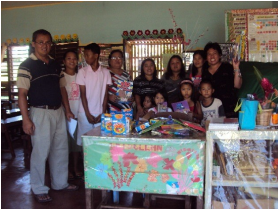
School supplies donated for poor children in Cagayan de Oro City, Philippines

Phone: 208-267-9319 E-mail: life_aid_foundation@yahoo.com Websites: http://fhm.spruz.net http://laf.spruz.com/