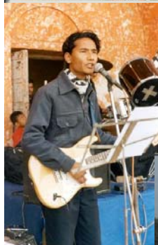
Above: Congregation of believers in Bhutan Left: Leading praise and worship Below: Bhutan terrain & crude bridge on path to minister in remote village.