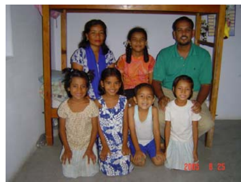
The 2 girls Front Left need sponsors.