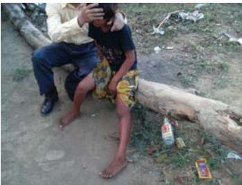
Left: Praying for a boy after caroling. Center and Bottom: Food Distribution.

some had none. This event made the team realize that "though there are many times we feel low and down due to difficulties, we do not have the right to question God." God opened their eyes to see how truly blessed they are as they went to the poorest families. These families had hardly anything, not even a decent place to live or lay down, yet they still managed to smile and pursue life. Truly a life in God is a life worth living. We're grateful to have the privilege to support these ministers in prayers and finances. We desire to do so much more and believe God will make that possible soon. Thanks for your prayer support.