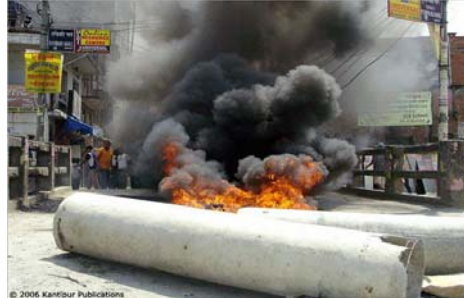
Bombing in Kathmandu, Nepal

On Tuesday, Nov. 21, 2005, the Government of Nepal and the Maoists signed the much anticipated and long awaited comprehensive peace agreement, formally ending the decade long armed Maoist insurgency. There were constant killings of innocent people and thousands of children were orphaned. The situation in the natural looked hopeless, but due to the prayers of God's people,