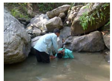
Below: Baptism of new believer in Bangladesh in May of '08.