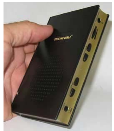
Above: Picture of a Talking Bible

We are praying for provisions to send 15 indigenous missionaries to live in 15 different villages to share the Gospel daily with them for at least a year. These men are trained and ready to go. They are only waiting on the means.