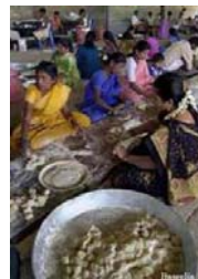
(Left) Giving food to the survivors.

with their fellow believers are working night and day to bring some relief and show God's love to these people. Check the back page for ways you can be sure your help will go to fellow believers.