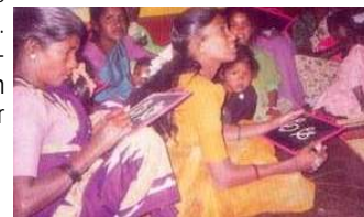
Hindapurra Village and Literacy Class

attending the classes. Now many in that colony are believers in Jesus. They provide medicines, clothes and children's education. Decent housing and clean drinking water is needed.