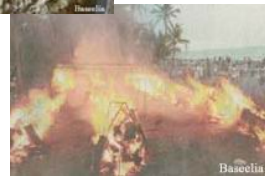
(Below) Burning dead bodies 100 at a time.