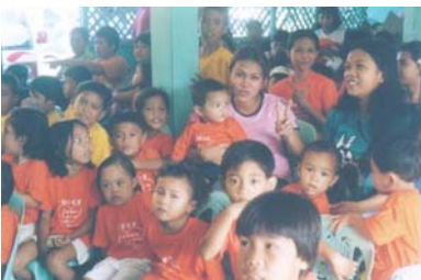
Children and mothers hearing about Jesus