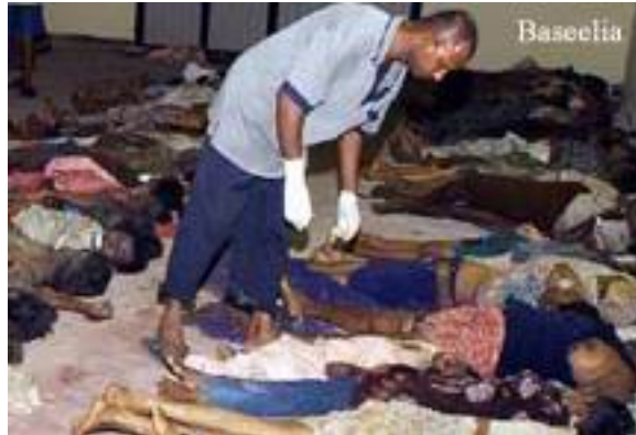
Christian relief worker (above), burning dead bodies to curb disease & feeding survivors (below).

Mere words can NOT express the horrific devastation left in the wake of the tsunami; literally thousands of dead bodies waiting to be claimed by relatives. However, these things should not come as a surprise to believers, since they are foretold in Mt. 24:7 says "There will be famines and earthquakes in various