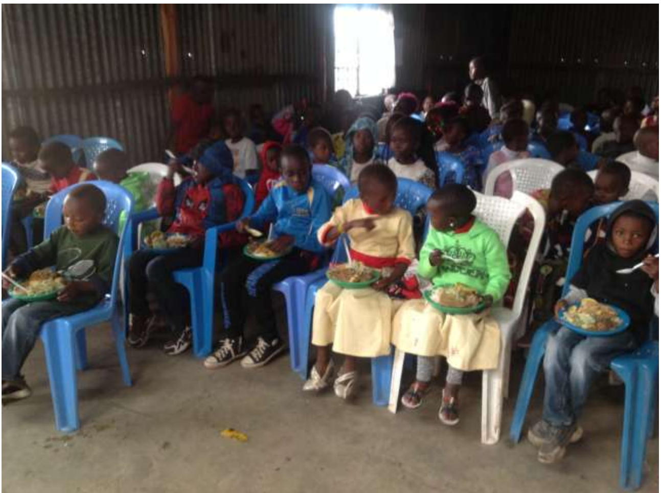
PHOTO ABOVE (25 TH DECEMBER, 2022): CHILDREN ENJOYING BIG MEAL 2022 AT THE PFJM NAROK TOWN CHURCH SANCTUARY ON SUNDAY 25 TH DECEMBER, 2022.

Sunday 31 st December 2023: Evening through to 1 st January 2024 morning to end at 6:00a.m: End year Prayer Vigil.