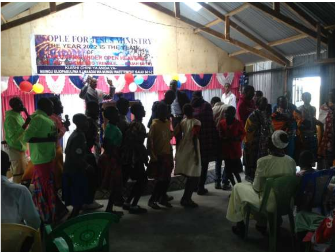
PHOTO ABOVE: PFJM OLOOLTOTO NAROK BRANCH CHURCH SINGING AT NAROK TOWN CHURCH ON 2 ND OCTOBER 2022.