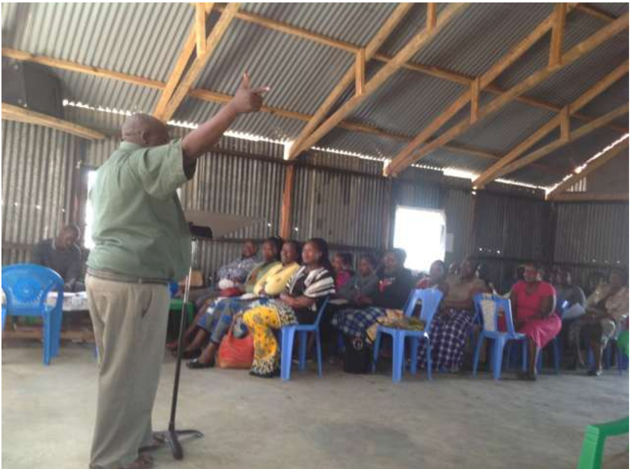
PHOTO ABOVE: A BUSINESS EXPERT GUEST SPEAKER ADDRESSING THE PFJM BUSINESS DEPARTMENT MEMBERS MEETING ON 10 TH OCTOBER 2022 AT THE PFJM NAROK TOWN CHURCH SANCTUARY IN MOTONYI AREA OF NAROK TOWN.

People For Jesus Ministry (PFJM) has a missions/Outreach team run by the Missions/Outreach Council that plans and implements local, regional and international missions and outreach programmes. That includes crusades, church planting, prayers and intercessory prayers, community evangelistic Outreach programmes and projects. The team and the council also mobilizes, recruits, sends and support long-term and short-term missionaries and teams to different parts of the world. The Mission Council also hosts volunteer missionaries from every part of the world. The Mission team meets every month to pray, plan and implement Church missions and outreach programmes. Please contact us for details on how you can participate in any of our short term and long term missions/outreach programmes/projects. We are currently doing a Church plant in Narok Kenya--Tanzania boarder at Loita and at Nyang'ande in Kisumu County. Our evangelism and discipleship outreach team will visit Uganda Iganga in March 2023 and Tanzania Morogoro and Dar Es Salam in August 2023.