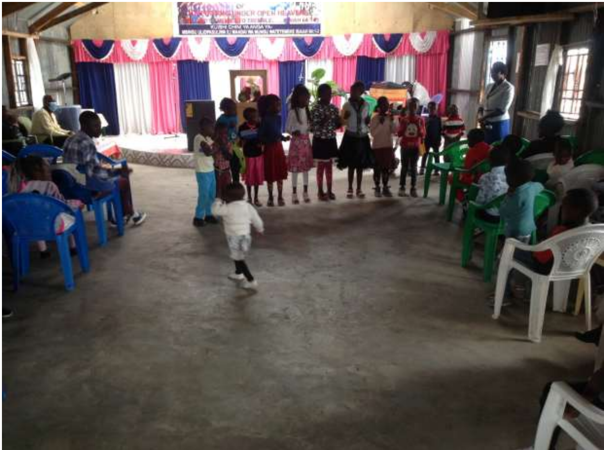
PHOTO ABOVE: PFJM NAROK TOWN CHURCH ANNUAL THANKSGIVING CELEBRATION ON 19 TH DECEMBER 2022. IT WAS A GREAT DAY TO ALSO AWARD CHURCH LEADERS AND CHURCH MEMBERS FOR EXCELLING IN DIFFERENT ASPECTS OF MINISTRY.

children and over 40 poor senior citizens in the project. The piece of land we have acquired will be used to begin the construction of three buildings of which one will be an office and two of them will be the place to host BIGOMI activities. We also want to construct a temporary Church sanctuary that will be used as a worship facility in the compound. Thanks to all partners for your continued support to the vulnerable people living with disabilities and the poor aged/senior citizens.