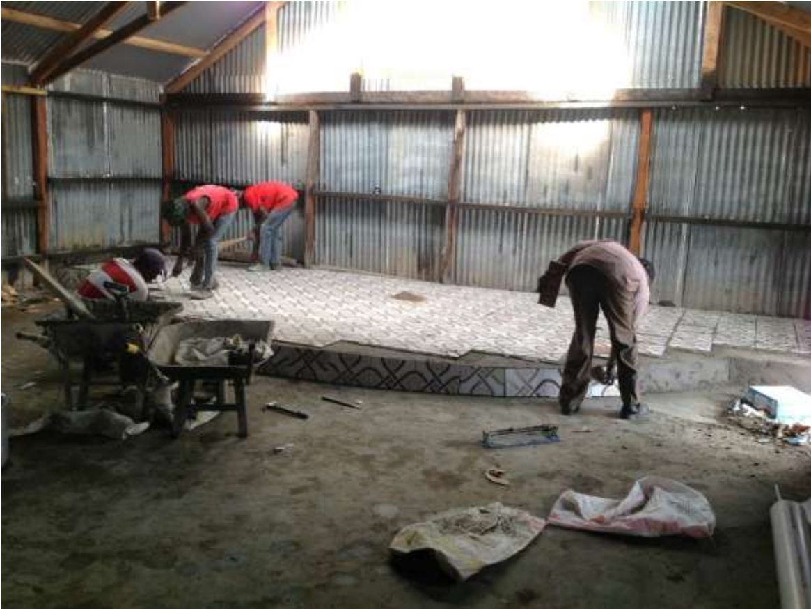
PHOTO BELOW: FINISHING TOUCHES OF THE PFJM NEW SANCTUARY AT MOTONYI AREA OF NAROK TOWN IN EARLY OCTOBER 2022.