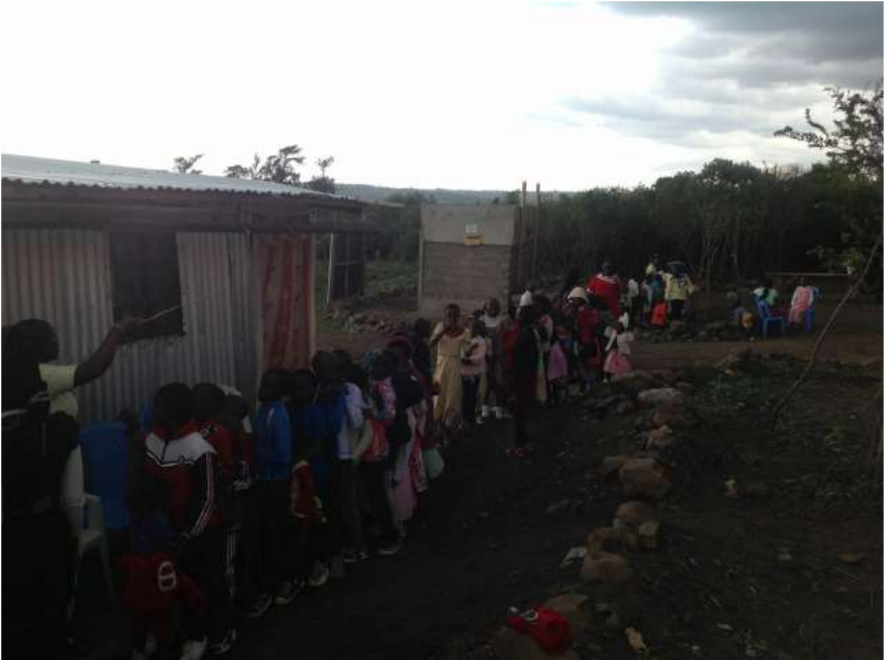
PHOTO ABOVE: CHILDREN LINING UP FOR PARTAKING OF THE BIG MEAL 2022 AT NAROK TOWN CHURCH. ABOUT 220 CHILDREN TOOK BIG MEAL 2022 IN THIS CHURCH ALONE.

>>> PFJM Branch Churches Licensing/Ordination activities in respective branches. Dates and venues to be known later.