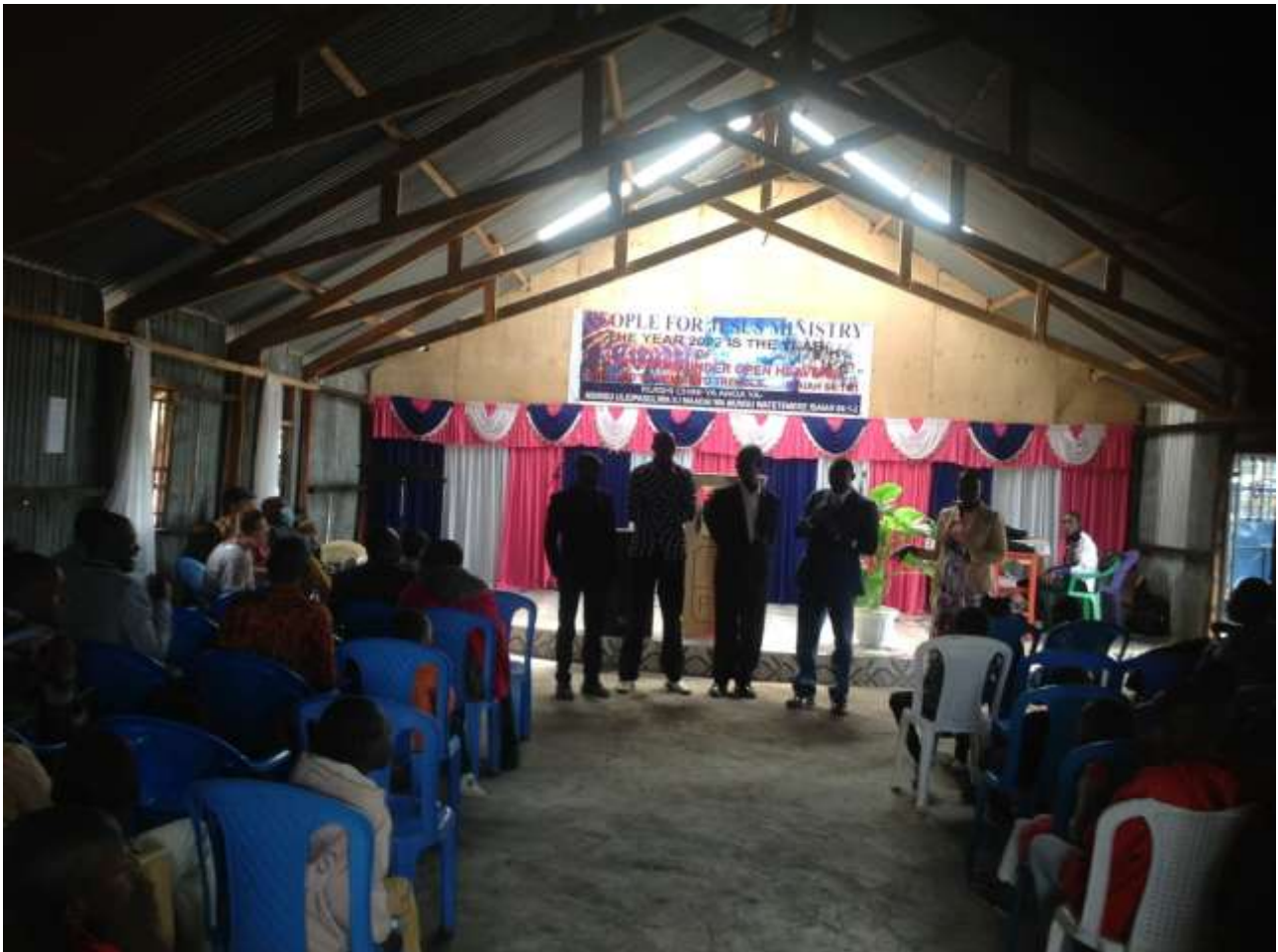
PHOTO ABOVE: SOME OF THE PASTORS WHO ATTENDED PFJM ANNUAL CHURCH LEADERSHIP EMPOWERMENT CONFERENCE INTRODUCING THEMSELVES AT THE JOINT SUNDAY WORSHIP SERVICE ON SUNDAY 20 TH NOVEMBER 2022 AT PFJM NAROK TOWN CHURCH.