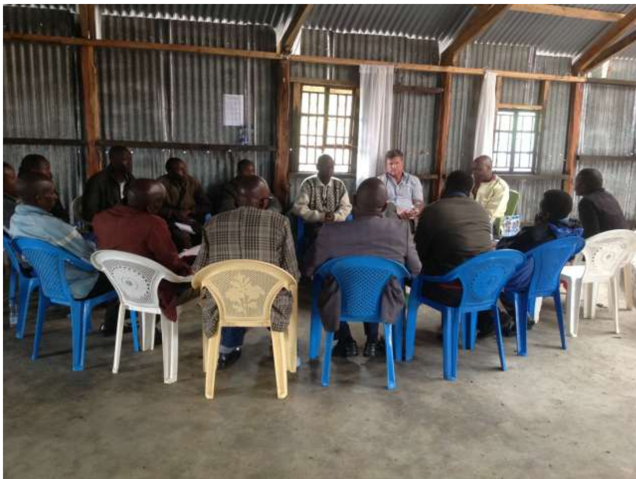
PHOTO ABOVE (17 TH NOVEMBER 2022) : PART OF MEN ONLY GROUP DISCUSSION SESSION OF PFJM 2022 ANNUAL LEADERSHIP CONFERENCE HELD AT PFJM NAROK TOWN CHURCH FOR PASTORS, BISHOPS AND OTHER CHURCH LEADERS. IN 2023, THE CONFERENCE WILL BE CALLED 'PRESSING ON -- KAZA MWENDO'