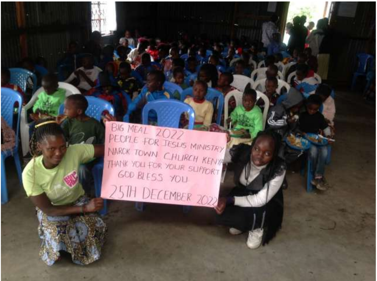
PHOTO ABOVE: PFJM IN KENYA SAYING LOTS OF THANKS TO THE SUPPORTERS AS THEY ENJOY BIG MEAL 2022 ON 25 TH DECEMBER 2022