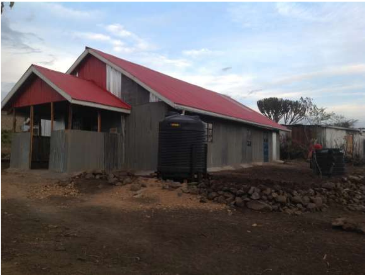
PHOTO ABOVE: THE NEW TEMPORARY SANCTUARY OF PFJM READY FOR OPENING ON 2 ND OCTOBER 2022 AT MOTONYI MOUNTAINS OF NAROK TOWN.