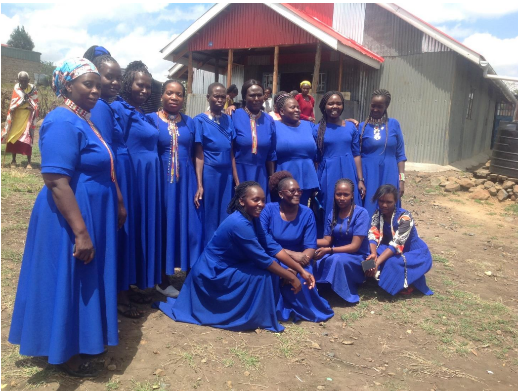
PHOTO ABOVE: PART OF PFJM NAROK TOWN CHURCH WOMEN MINISTRY MEMBERS ENJOY THEIR TIME TOGETHER AFTER WOMEN MINISTRIES DAY ON SUNDAY 24 TH SEPTEMBER 2023.

OUR ADULT EDUCATION CLASSES ARE GOING ON WELL. 85% OF THE CLASS ARE WOMEN AND GIRLS. THE PROBLEM OF EARLY MARRIAGES AMONG THE MAASAI GIRLS NECESSITATES THAT THEY DROP OUT OF SCHOOL OR NEVER MAKE IT TO SCHOOL SO THAT THEY GET MARRIED AND EARN THEIR FAMILY A WEALTH OF MANY COWS PAID AS DOWRY. THE CHURCH IS ADDRESSING THAT EDUCATION GAP BY CONDUCTING CLASSES FOR THOSE WHO HAVE EITHER DROPPED OUT OF SCHOOL OR THOSE WHO NEVER MADE IT TO ANY SCHOOL. THANKS TO THOSE WHO HAVE BEEN ABLE TO SUPPORT US. PLEASE JOIN US IN THIS ENDEAVOUR AT USD$70 PER MONTH PER CLASS. THE MAASAI COMMUNITY ARE BASICALLY PASTORALISTS AND THEY HAVE TO LOOK FOR PASTURE AND WATER FOR THEIR LIVESTOCK. THE CLASSES ARE WONDERFUL SINCE THEIR ROBUST RESUMPTION IN FEBRUARY 2023 . WE HAVE INTERGRATED CLASSES WITH INCOME GENERATING ACTIVITY TO ENABLE ADULTS EARN A LIVING AS THEY LEARN. WE CALL IT ' FEED BOTH THE MIND AND THE BODY '. IT IS A GREAT AVANEUE OF SHARING THE GOSPEL OF CHRIST.