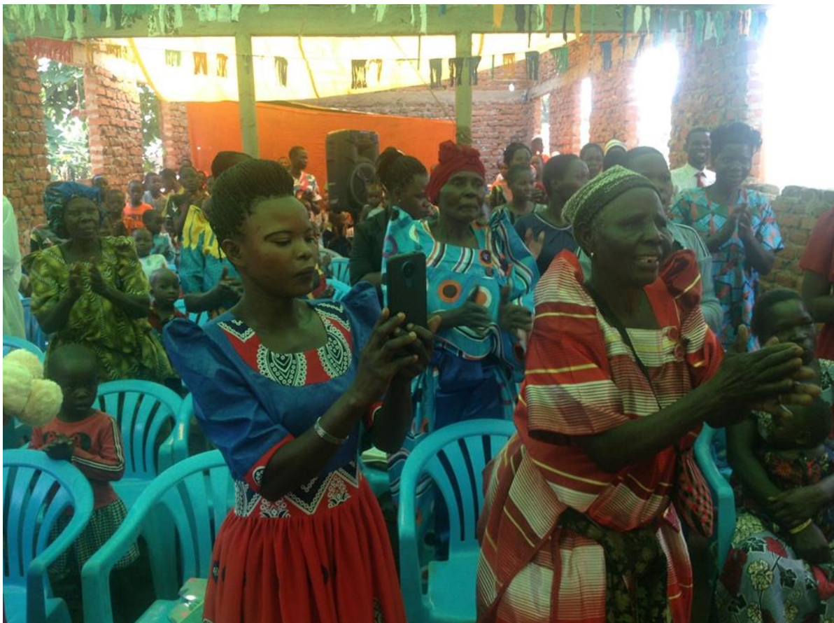
PHOTO ABOVE: SUNDAY WORSHIP SERVICE IN KIWANYI UGANDA ON 16 TH JULY 2023