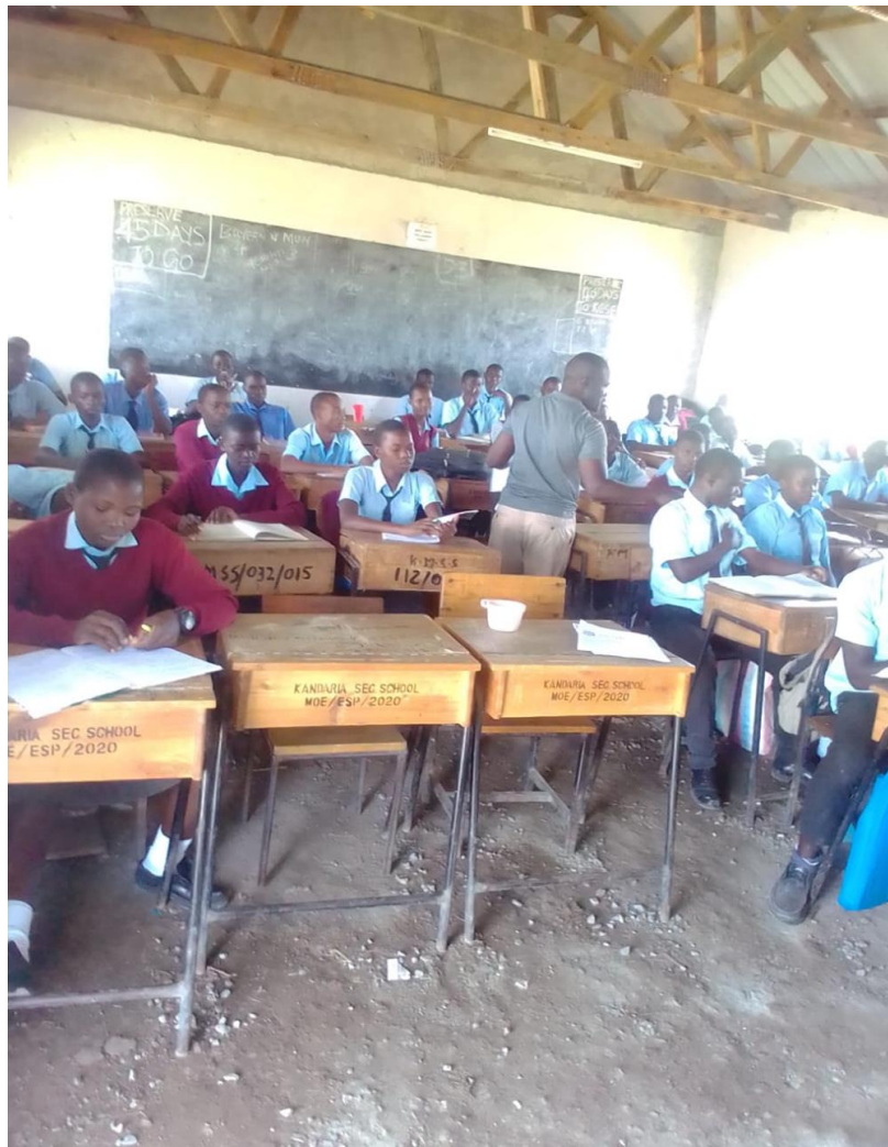
PHOTO ABOVE: CANDIDATE CLASS OF KANDARIA SECONDARY SCHOOL 2023 (51 STUDENTS) BEING OFFERED SPECIAL TUTION SESSIONS SUPPORTED BY THE CHURCH AND PARTNERS.

The construction of two laboratories of Kandaria secondary school were completed and the facilities are being used now. A proper kitchen and a dining hall, future dormitory and administration block are still needed at the school. Since many parents within Kandaria community are unable to pay fees due to poverty caused by floods. We are continuing to put funds in paying for extra time tuition costs for the whole candidate class of Kandaria secondary school and the outcome is good. We look forward to their better performance in national exams which they will be taking in November 2023.