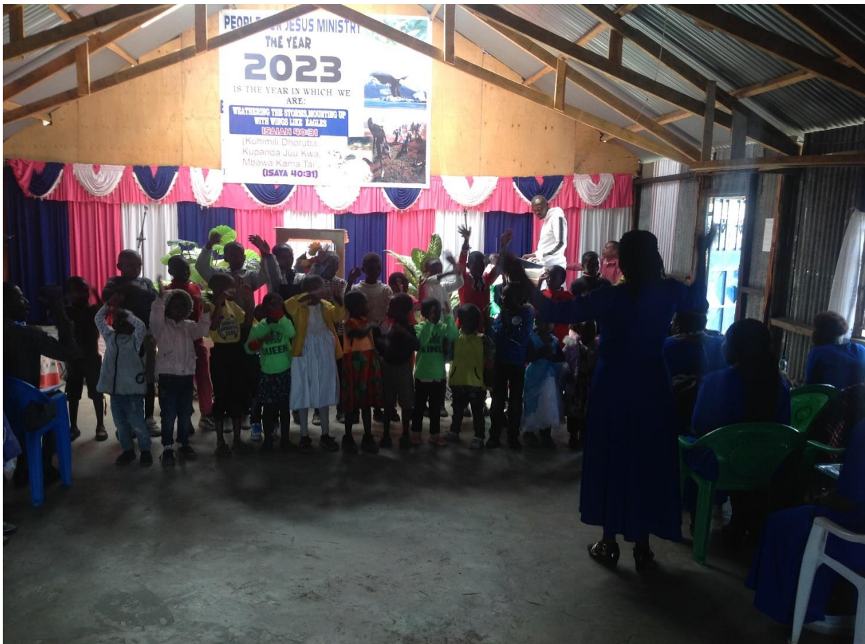
PHOTO ABOVE: PFJM NAROK TOWN CHURCH SUNDAY SCHOOL CHILDREN SINGING DURING A SUNDAY WORSHIP SERVICE ON 24 TH SEPTEMBER 2023.