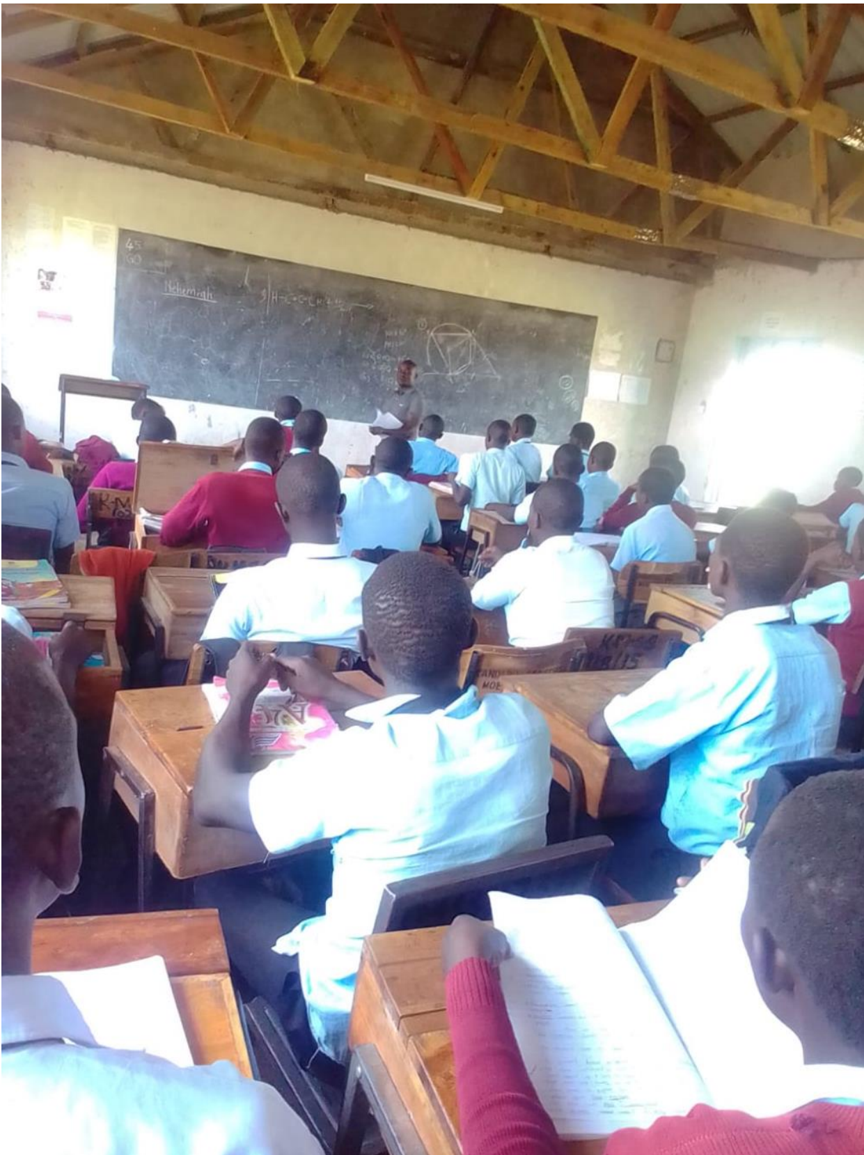
PHOTO ABOVE (23 RD SEPTEMBER, 2023): THE TEACHER FACILITATING THE SPECIAL LESSONS PAID FOR BY THE CHURCH/PARTNERS AT KANDARIA SECONDARY SCHOOL. THESE ARE 51 CANDIDATES TAKING NATIONAL EXAMINATION THIS YEAR AND THEIR PARENTS ARE UNABLE TO AFFORD TUITION FEES. WE HAVE CLEARED THEIR TUITION FEES THIS YEAR AND THEY ARE GETTING PREPARED VERY WELL FOR THE EXAMINATIONS THAT WILL BE DONE IN NOVEMBER THIS YEAR